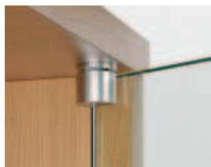
For glass/wood constructions