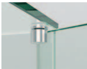
For all-glass constructions