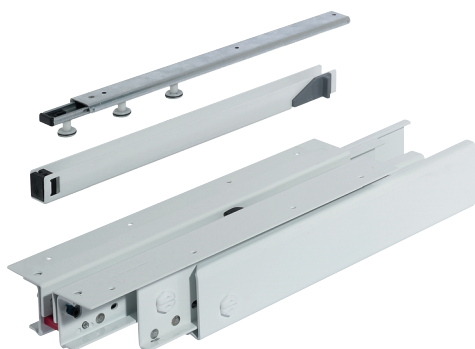
Top and bottom runners