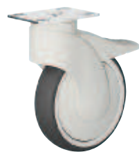
Free running, with brake