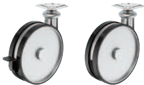
Free running, with brake Free running