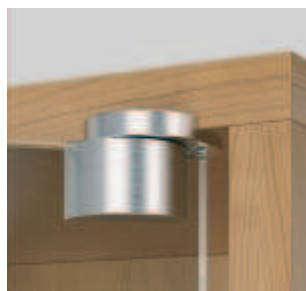
For glass/wood constructions