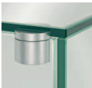
For all-glass constructions