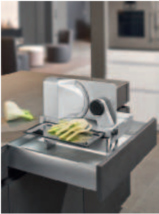
Picture shows AES 62 SR/SL, cutting right